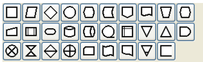
Figure 6.7: Flowchart

A group dedicated to providing the user shapes which are commonly used in flow charts. Flow charts can be routinely found in computer programming, marketing, economics, and any other semi-linear operation which requires planning. Most flowchart objects allow entry of text.