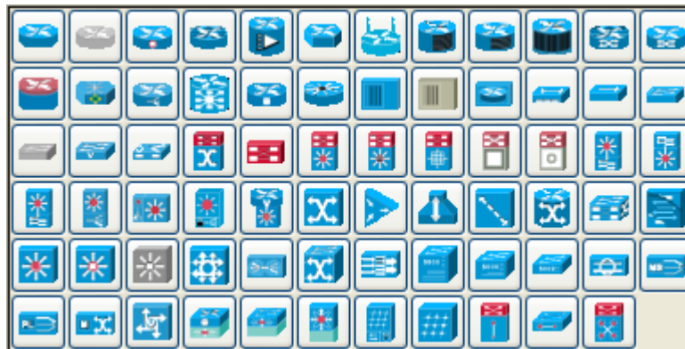
Figure 6.5: Cisco - Switch

Cisco - Switch includes shapes representing switch equipment from Cisco, a manufacturer of Computer Networking Equipment.